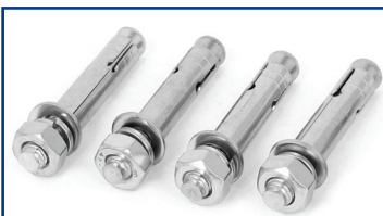
Concrete bolts (included)

Bolt Types: Choose the correct bolts for the surface you are fitting the parking post to ie: concrete/tarmac. 4 concrete bolts are included, but if you require tarmac bolts these will need to be purchased separately. Check diameter of bolts required.