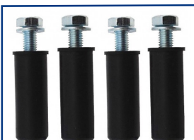
Tarmac bolts (NOT included)